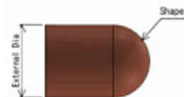
External Appearance A